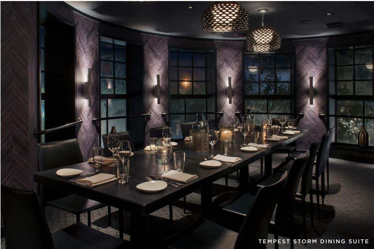
TEMPEST STORM DINING SUITE