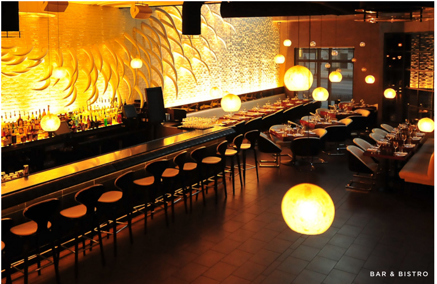
BAR & BISTRO