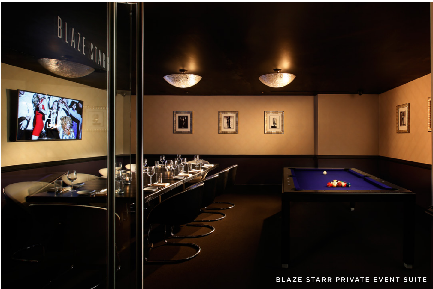
BLAZE STARR PRIVATE EVENT SUITE